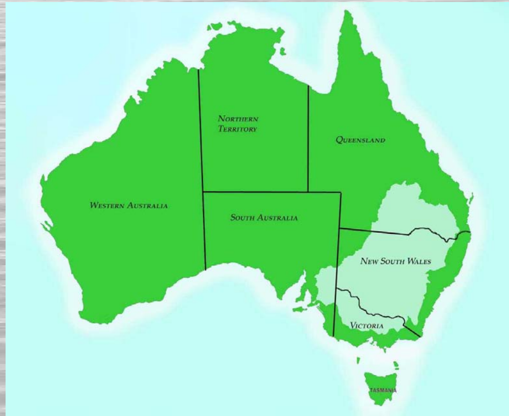
Map of Australia and Murray-Darling Basin (MDA, 2007)