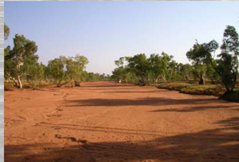
Todd River, Northern Territory