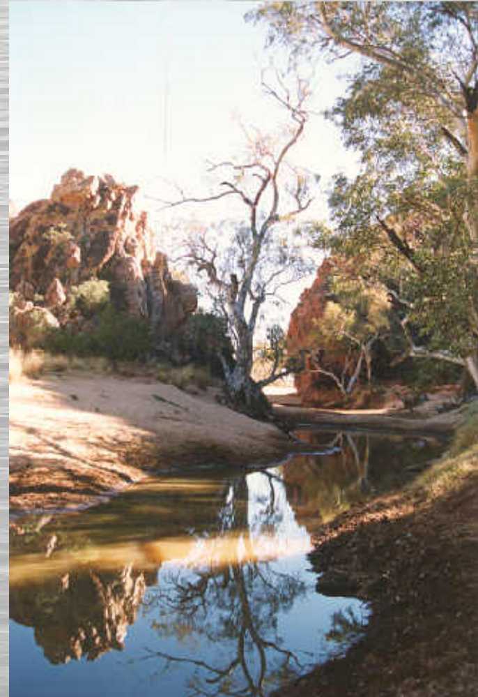
MacDonnell Ranges, Northern Territory