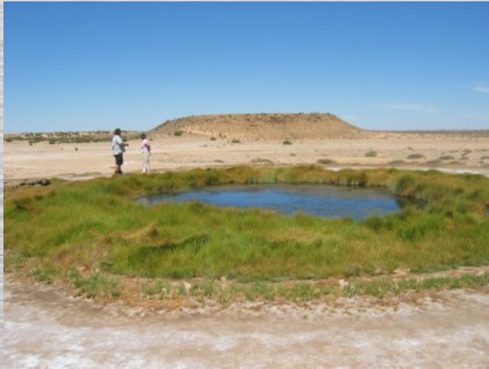
Blanche Mound Springs, South Australia