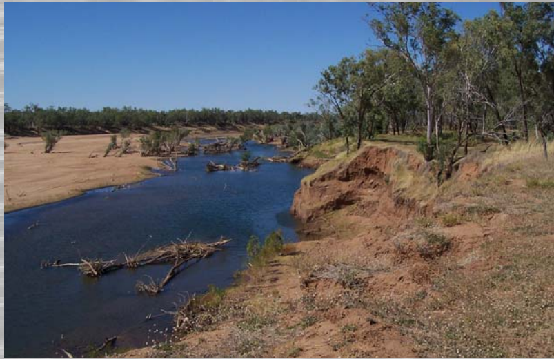
Fitzroy River, Queensland