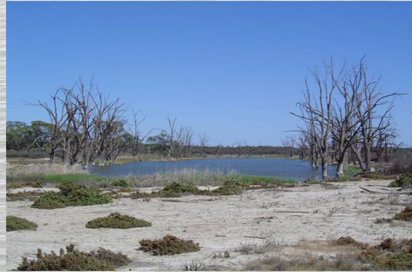
Typical picture of salinity, Victoria